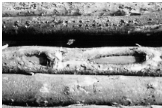
Figure 1. Charred fibre in catfaces.

The focus in the woodlands has been on implementing new utilization specifications and improving log quality. Increasing the acceptable minimum top diameter means small diameter logs are not harvested and thus the subsequent problem of removing