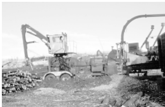
Figure 4. Peterson DDC 5000 processing burned logs.

Salvaging stands of small diameter burned timber is frequently not economical because of the high percentage of pulp logs in these stands. This, combined with the difficulty in removing the charred bark from small diameter stems using ring debarkers, means alternative processing methods are necessary to be cost effective. In-woods chipping was one method used by a contractor operating with Blue Ridge Lumber. Woodlands staff identified an area composed of small diameter stands in the Virginia Hills suitable for in-woods chipping. Using a feller-buncher, the logging contractor conducted an initial sort at the stump, separating sawlogs from pulp logs. At the landing, the chipper operator removed any remaining sawlogs before feeding the pulp logs to a Peterson Pacific Corporation DDC 5000 portable chip plant (Figure 4). The chips were screened to remove the fines and then transported by truck to a bleached chemithermomechanical pulp (BCTMP) mill in Taylor, B.C.