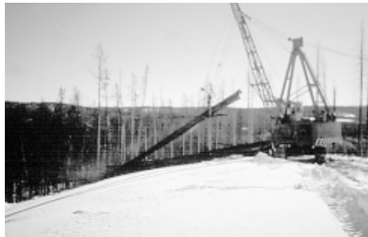
Figure 3. Madill 122 grapple yarder.

Buchanan Lumber operated a chip-and-saw mill in the Virginia Hills to process cut-to-length burned spruce and pine logs 5.5-m long into rough cants. The cants were shipped to Buchanan's mill near High Prairie